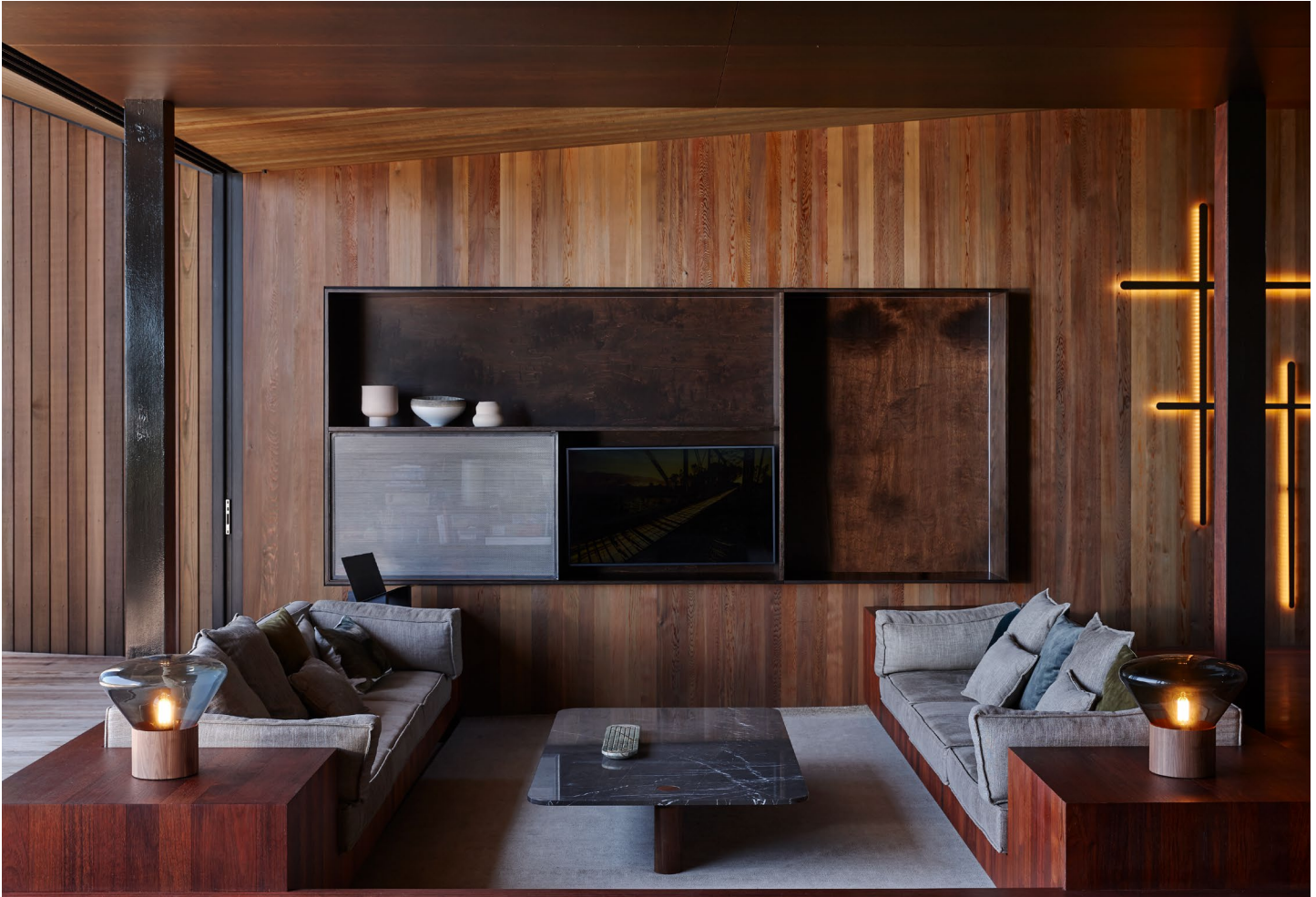
Lined in timber, the interiors continue the materiality of the exterior while creating a cosseted sense of protection.